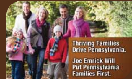
Election postcards sent to Pennsylvania and Indiana families in partnership with Pennsylvania Family Council and Indiana Family Action.