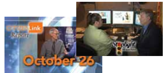
From top to bottom: The newly redesigned CitizenLink website—CitizenLink.com and Daily Update e-mail; images of CitizenLink Report and Stoplight® online videos.