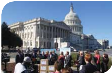
Delivery of more than 150,000 petitions opposing taxpayer funding of abortion in the health care reform bill.

important purpose of reminding voters—and the legislators who failed to represent their constituents—that our system of government provides citizens the ability to hold politicians accountable for their actions.